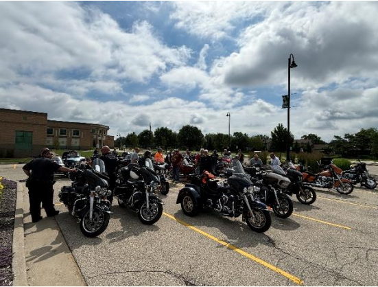
Left: Getting Ready to mount up.