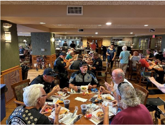
The Regency graciously provided a tasty lunch for all.